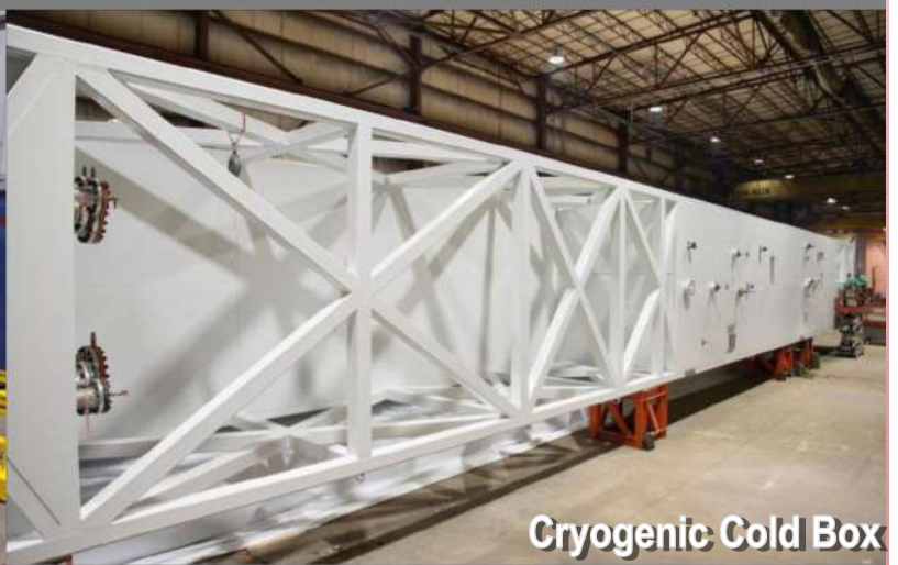
Cryogenic Cold Box