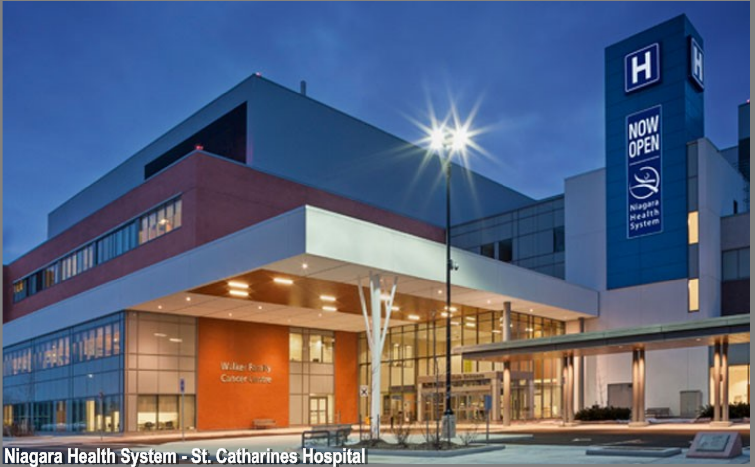
Niagara Health System - St. Catharines Hospital