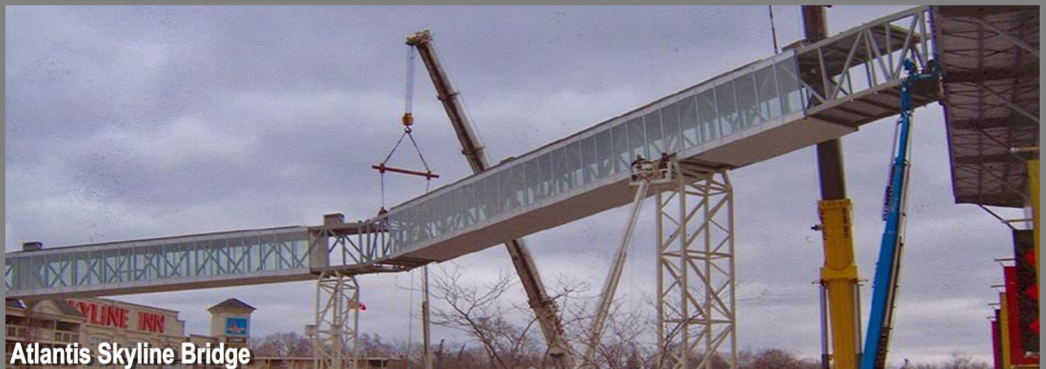
Atlantis Skyline Bridge