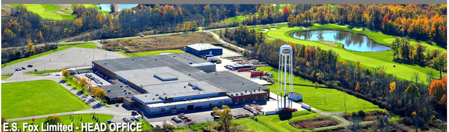
E.S. Fox Limited - HEAD OFFICE