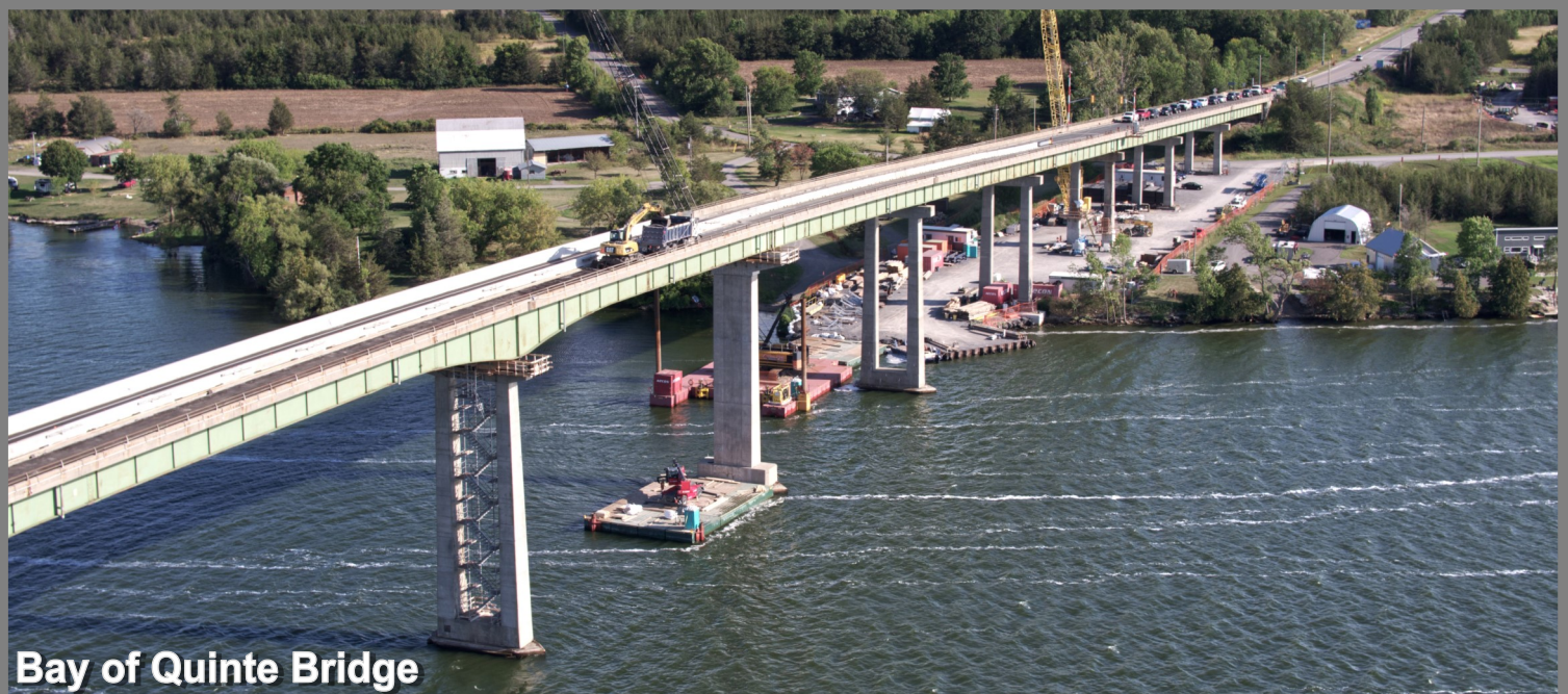
Bay of Quinte Bridge

HEAD OFFICE P.O. Box 1010 9127 Montrose Road Niagara Falls, Ontario L2E 7J9 TELEPHONE: 905-354-3700 WEBSITE: www.esfox.com