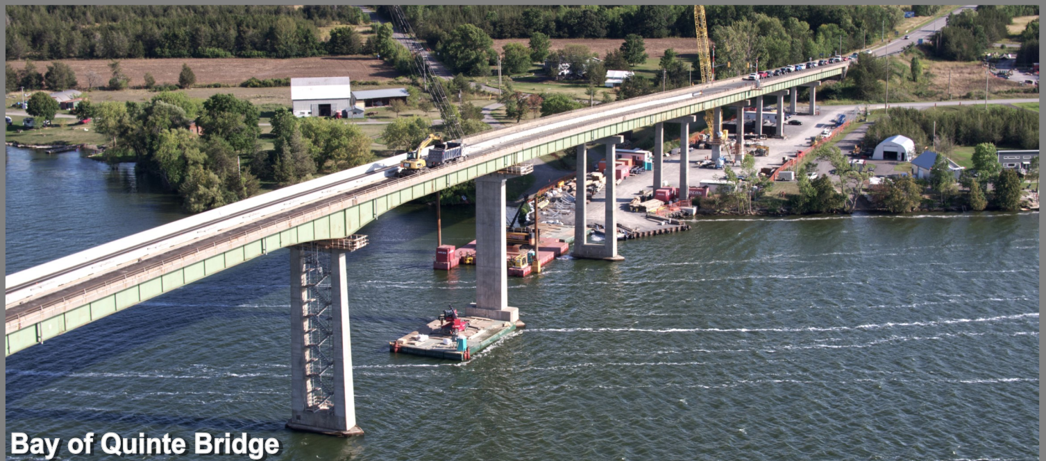
Bay of Quinte Bridge