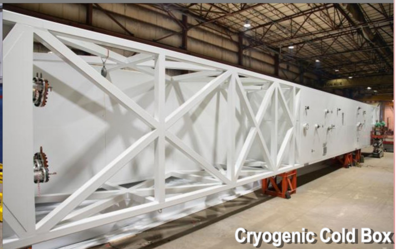
Cryogenic Cold Box